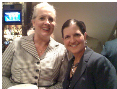
WIA Networking at AIAA Space 2010 Conference Anaheim, California