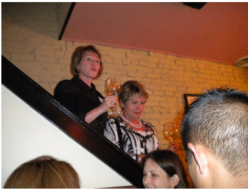
WIA-WID Joint Happy Hour Washington, D.C.