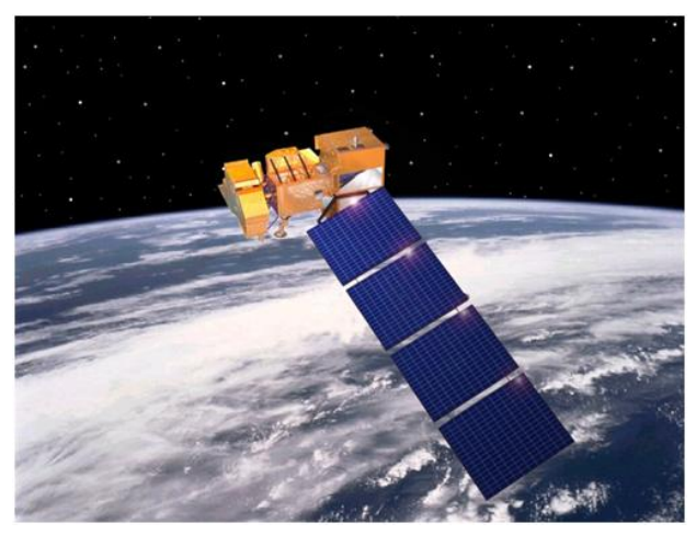
Artist's Conception of Landsat 7 in orbit

Thank you to our premier sponsor, EADS North America, for their support of this event and our event sponsor Raytheon Company.